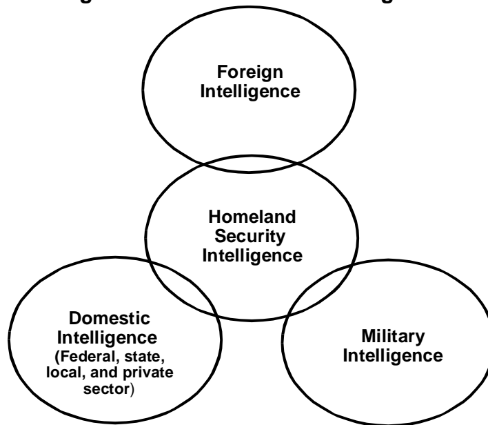
Figure 1. Dimensions of Intelligence

Leaders within the Intelligence and Homeland Security communities often speak openly about the responsibilities, priorities, accomplishments, and challenges their agencies face. DNI John Negroponte recently stated that the Intelligence Community has tasked itself with “bolstering intelligence support for homeland security as enterprise objective number one.” 14 He spoke of this priority within the context of the DNI’s mandate resulting from the Intelligence Reform and Terrorism Prevention Act (IRTPA) of 2004 to “integrate the foreign, military and domestic dimensions of the United States intelligence into a unified enterprise” and “connecting the dots across the foreign-domestic divide.” 15 At the aggregate level, even if it is assumed that there is one unified intelligence discipline, according to DNI Negroponte, there are three different dimensions of intelligence — foreign, military, 16 and domestic. Under this school of thought, HSINT could become another dimension of intelligence that is distinct in some manners, yet overlaps with the aforementioned dimensions. At a relatively simplistic level, the relationships among the dimensions of intelligence could be depicted according to Figure 1 below.